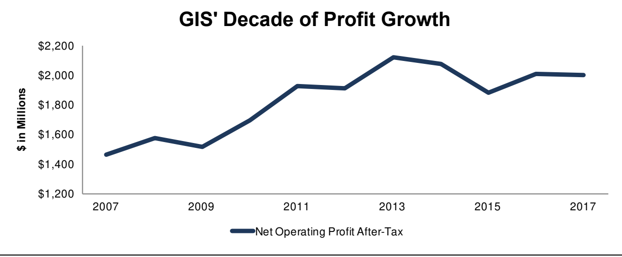
Figure 1: GIS NOPAT Growth Since 2007