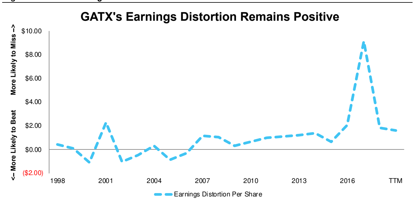
Figure 3: GATX's Earnings Distortion Per Share Since 1998

GATX's earnings distortion has been significant through most of the firms history and is currently higher than most years in the past, per Figure 3.