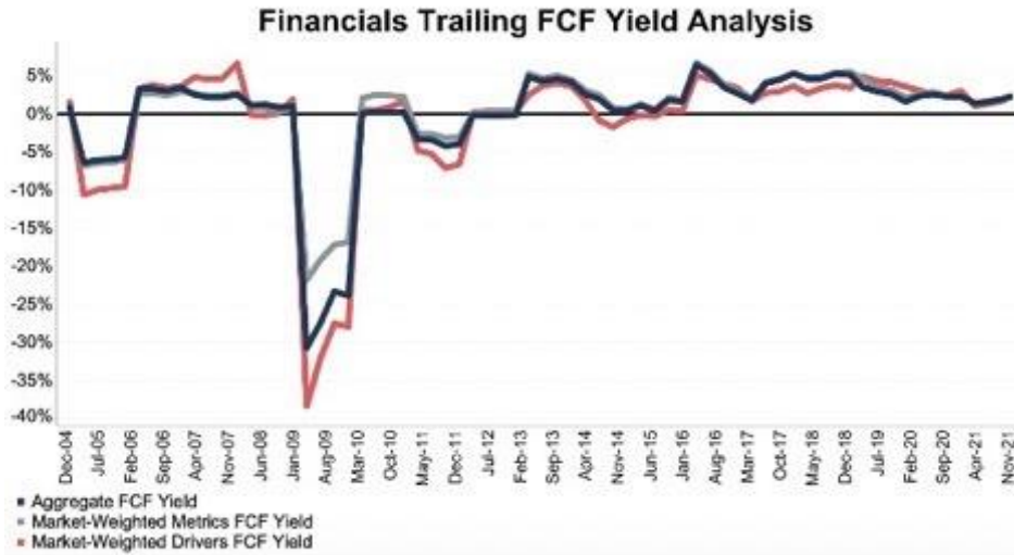
Figure 3: Financials Trailing FCF Yield Methodologies Compared: December 2004 – 11/16/21

Sources: New Constructs, LLC and company filings. The November 16, 2021, measurement period uses price data as of that date and incorporates the financial data from 3Q21 10-Qs, as this is the earliest date for which all the 3Q21 10-Qs for the S&P 500 constituents were available.