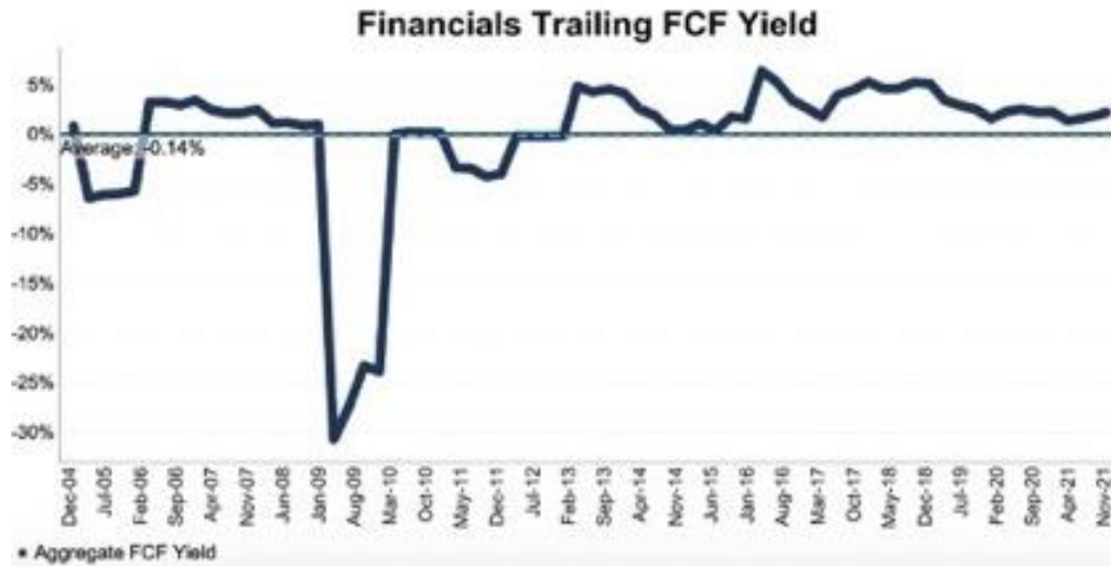
Figure 1: Financials Trailing FCF Yield: December 2004 – 11/16/21

The November 16, 2021, measurement period uses price data as of that date and incorporates the financial data from 3Q21 10-Qs, as this is the earliest date for which all the 3Q21 10-Qs for the S&P 500 constituents were available.