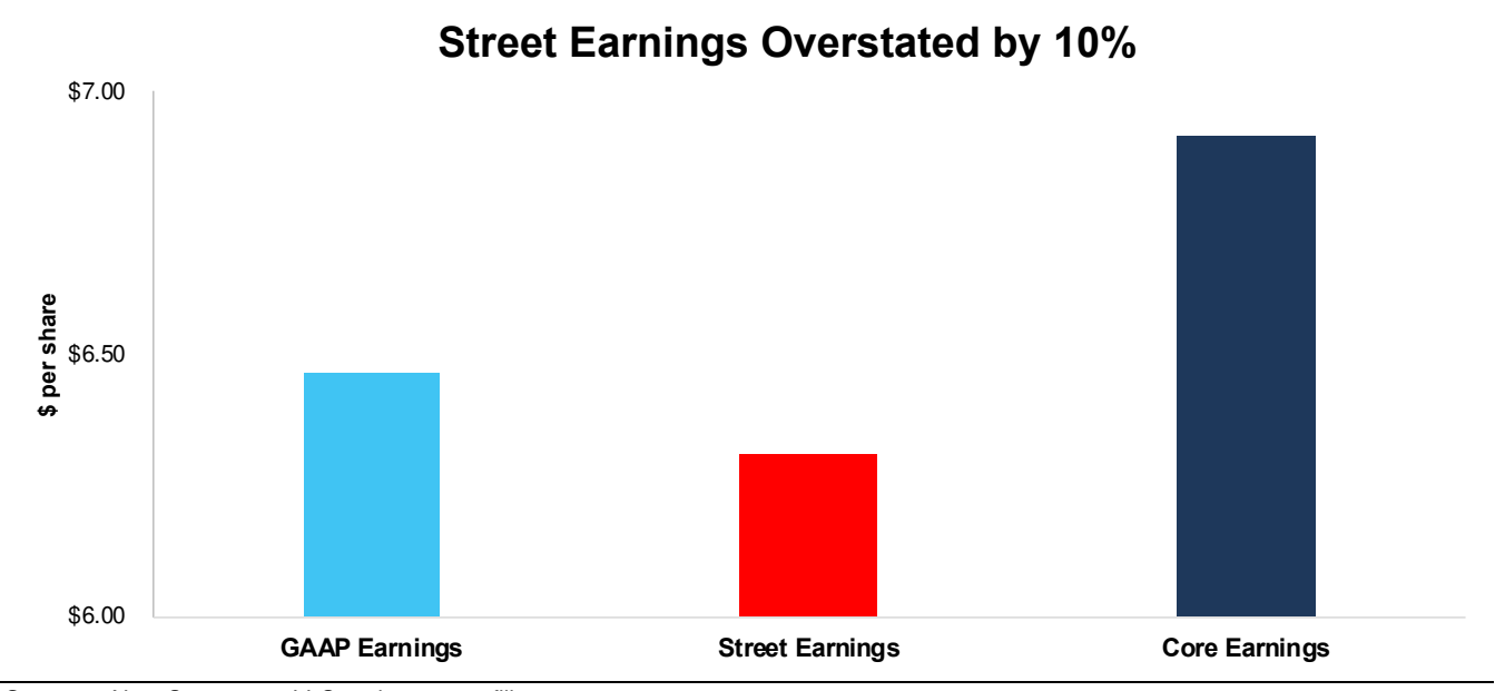
Figure 5: Comparing PulteGroup's GAAP, Street, and Core Earnings: TTM as of 3Q21

Sources: New Constructs, LLC and company filings.