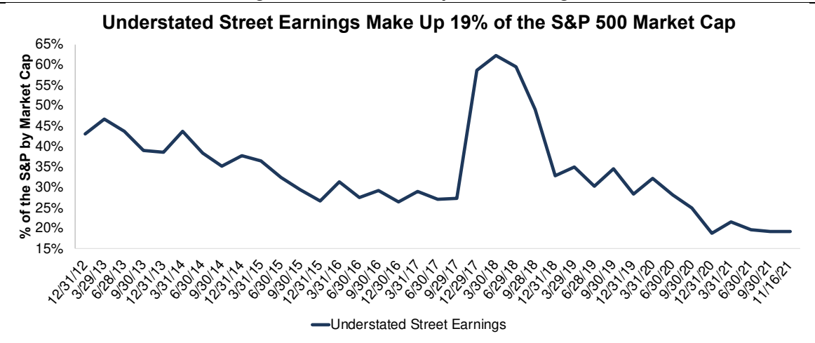
Figure 2: Understated Street Earnings as % of Market Cap: 2012 through 11/16/21

Sources: New Constructs, LLC and company filings.