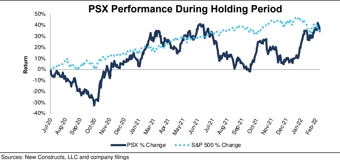
Figure 1: Long Idea Performance: From Date of Publication Through 2/15/2022