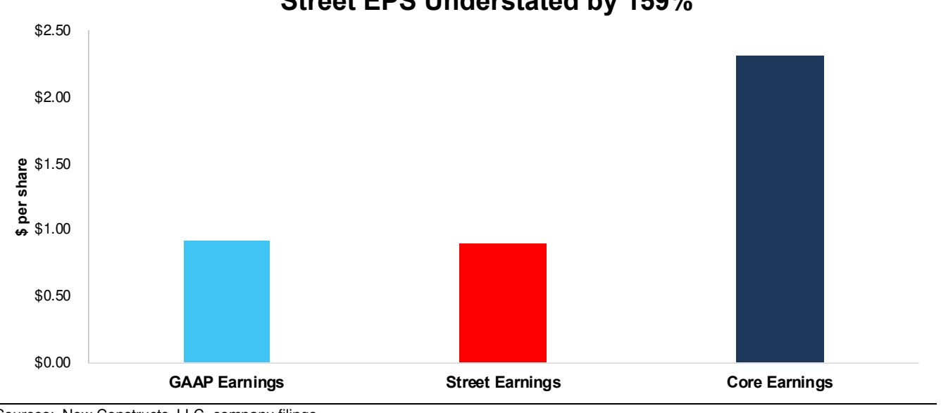
Figure 4: Comparing Match Group's Core, Street, and GAAP Earnings: TTM Through 1Q22