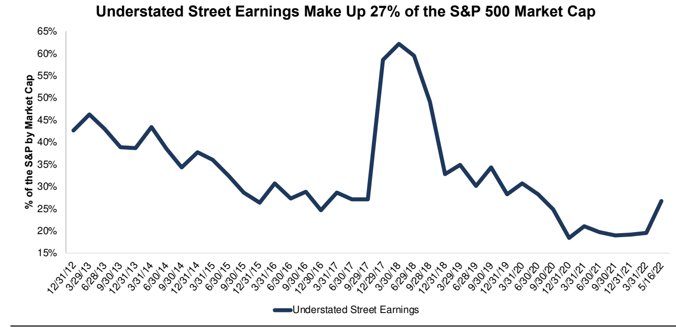
Figure 1: Understated Street Earnings as % of Market Cap: 2012 through 5/16/22