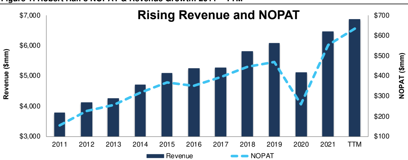
Figure 1: Robert Half's NOPAT & Revenue Growth: 2011 - TTM

After falling in 2020 due to the pandemic-driven decline in demand for its services, Robert Half's net operating profit after tax (NOPAT) over the trailing-twelve-months (TTM) has risen above pre-pandemic levels. Longer term, Robert Half has grown revenue and NOPAT by 6% and 14% compounded annually, respectively, over the past ten years. See Figure 1. The company's NOPAT margin rose from 4% in 2011 to 9% TTM, while invested capital turns improved from 3.7 to 5.2 over the same time. Rising NOPAT margins and invested capital turns drove the company's ROIC from 15% in 2011 to 48% TTM.