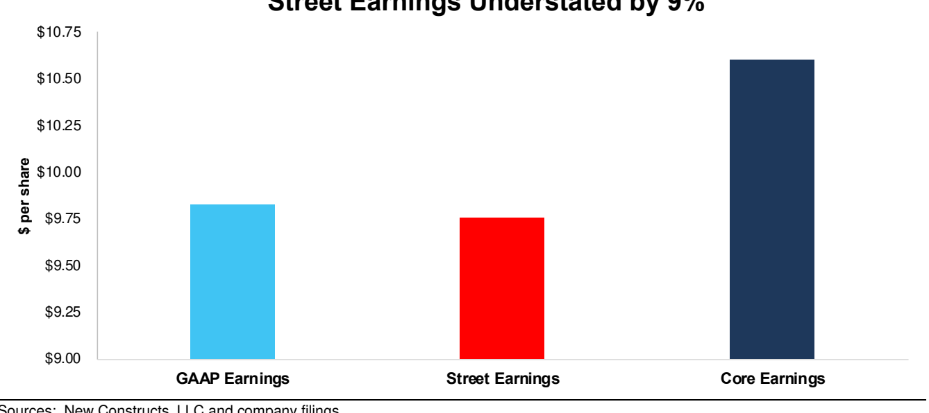
Figure 4: Comparing PulteGroup's GAAP, Street, and Core Earnings: TTM Through 3Q22