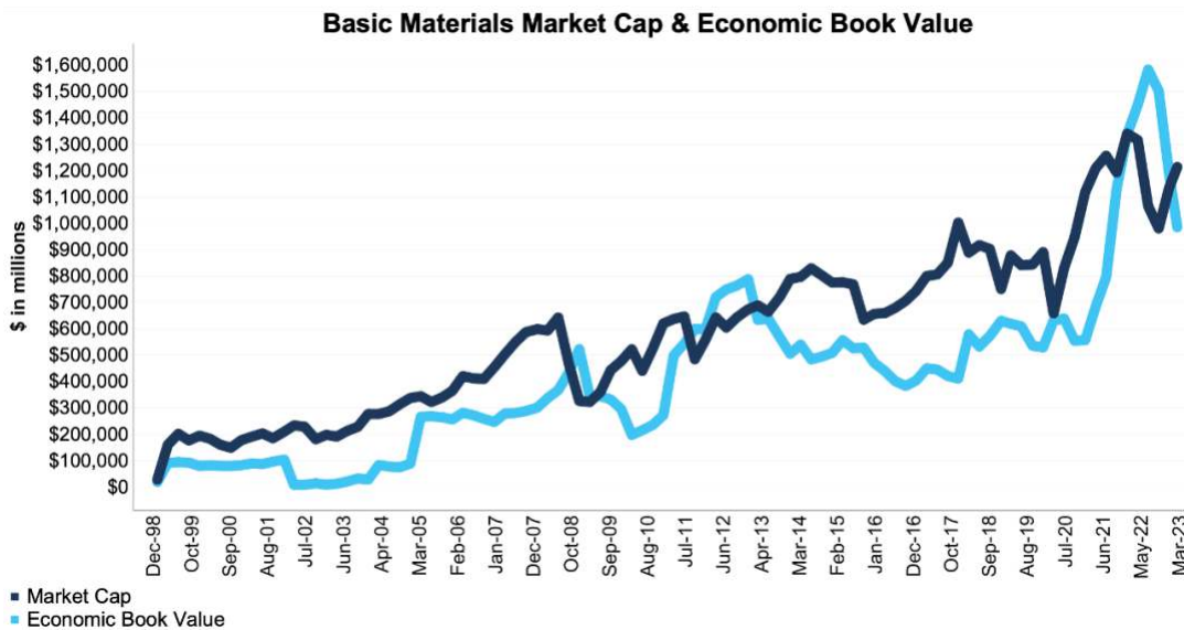
Figure 2: Basic Materials Market Cap & Economic Book Value: December 1998 – 3/8/23

The March 8, 2023 measurement period uses price data as of that date and incorporates the financial data from 2022 10-Ks, as this is the earliest date for which all of the 2022 10-Ks for the NC 2000 constituents were available.