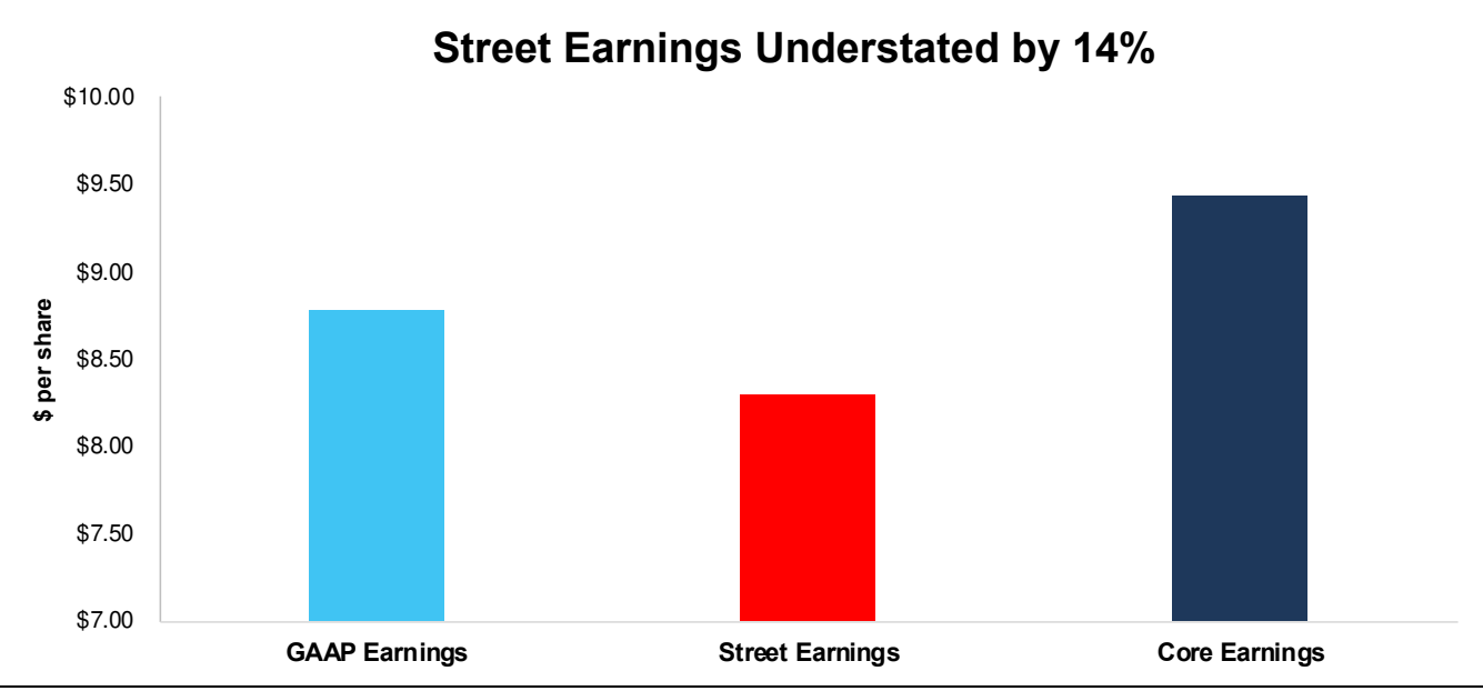
Figure 5: Comparing Occidental's GAAP, Street, and Core Earnings: TTM 1Q23