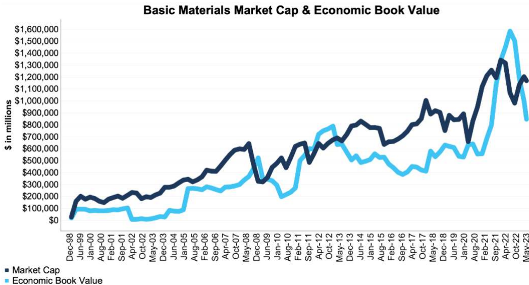
Figure 2: Basic Materials Market Cap & Economic Book Value: December 1998 – 5/15/23

The May 15, 2023 measurement period uses price data as of that date and incorporates the financial data from 1Q23 10-Qs, as this is the earliest date for which all of the 1Q23 10-Qs for the NC 2000 constituents were available.