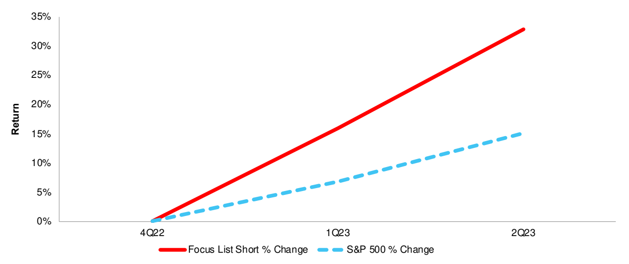
Figure 1: Focus List Stocks: Short vs. S&P 500 in 1H23

For real-time tracking of this Model Portfolio, see the index Thematic created for it.