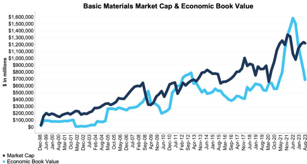
Figure 2: Basic Materials Market Cap & Economic Book Value: December 1998 – 8/15/23

The August 15, 2023 measurement period uses price data as of that date and incorporates the financial data from 2Q23 10-Qs, as this is the earliest date for which all of the 2Q23 10-Qs for the NC 2000 constituents were available.