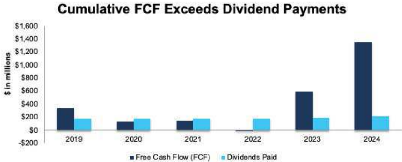
Figure 2: Ingredion's FCF vs. Dividends Since 2019