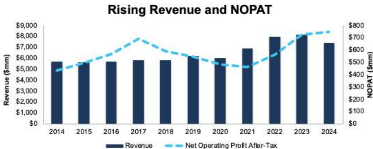
Figure 1: Ingredion's Revenue & NOPAT Since 2014